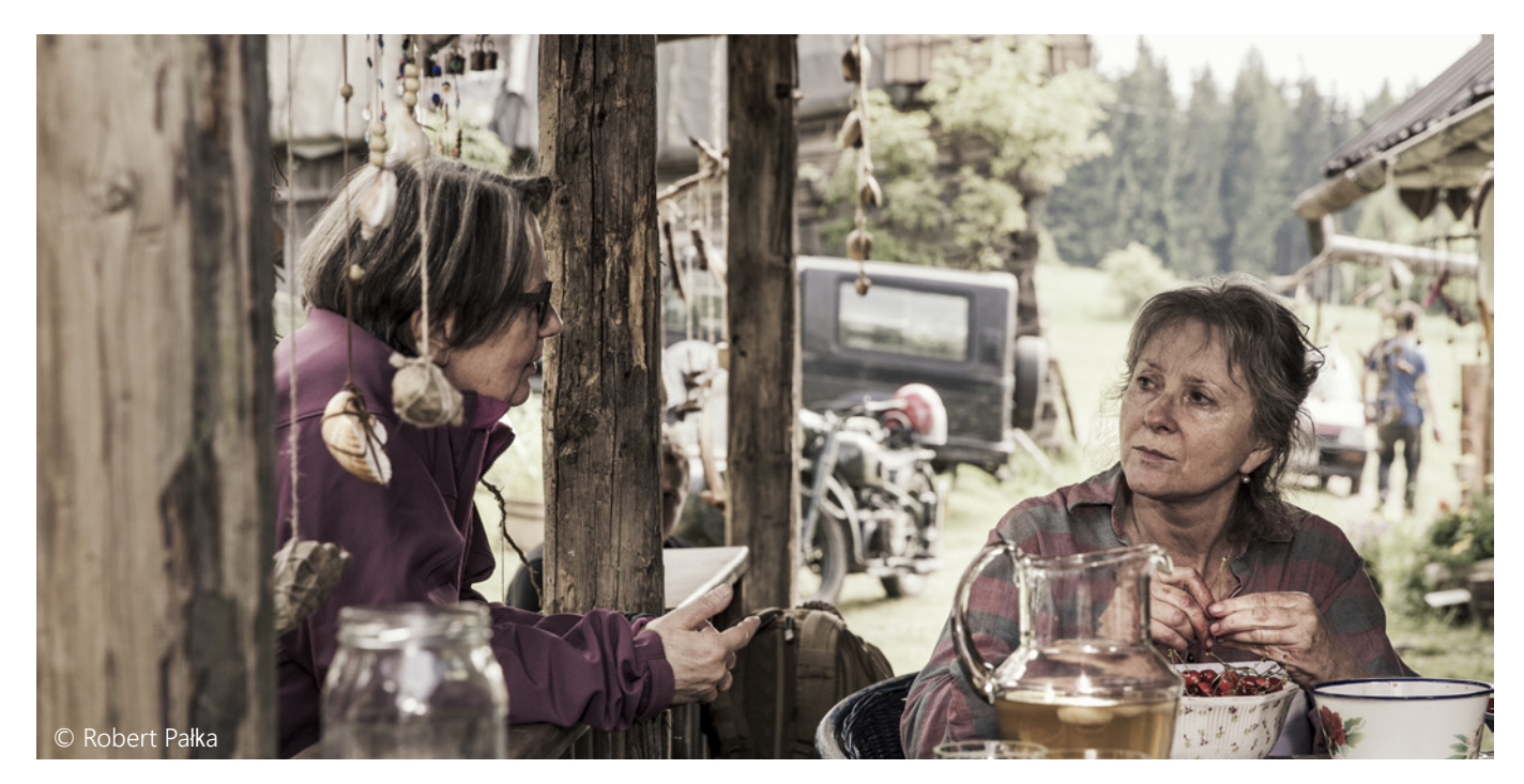
1981 - FEVER – Grand Prix, Gdynia Film Festival, 1985- ANGRY HARVEST – OSCAR nomination 1978 - PROVINCIAL ACTORS - International Critics Prize (FIPRESCI) at Cannes Film Festival