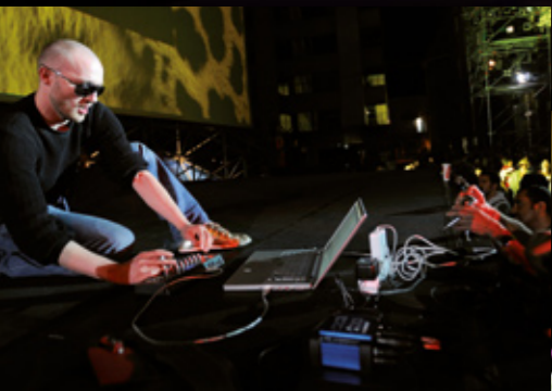
PAUL KALKBRENNER RAVING LOCARNO AFTER THE WORLD PREMIERE OF BERLIN CALLING.